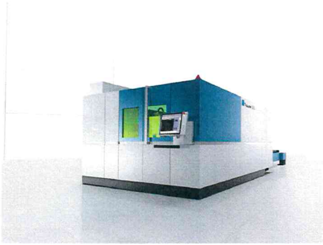
Our new Fiber Laser